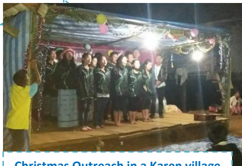
Christmas Outreach in a Karen village

The Karen typically do not celebrate the “25 th ” as Christmas Day but more the entire month of December. Yes...its Christmas EVERY day in December! Turkey and the trimmings are replaced by a stew that has bits and bobs thrown in throughout the day...and is eaten in the evening with family and friends. If there is one special day in December its usually the 05 December which is a joint celebration as it’s the King of Thailand’s birthday and Father’s Day as well.